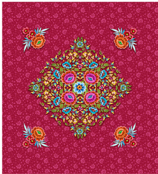
3 Shawl panel 45 x55cm