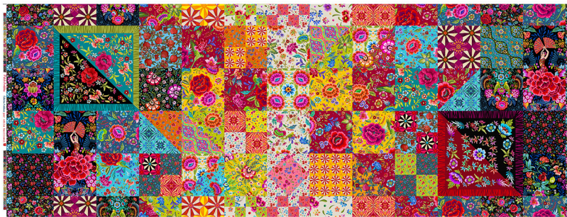
Andalusian Patchwork 150 x140cm